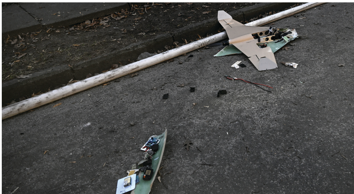
A downed Russian drone in Kyiv in March 2022.

UAVs, including combat drones, remain one of Moscow's pivotal combat elements against Ukraine. According to the Kremlin, at the start of the war in February 2022, Russian troops had approximately 2,000 military drones of all types at their disposal across the services and military commands. 43 By the end of 2022, several hundred of these drones had been destroyed by Ukrainian air defense, EW countermeasures, or Russian pilot errors. Still, Russian-made UAVs—including the Orlan-10 intelligence, surveillance, and reconnaissance (ISR) and Lancet-3 loitering kamikaze drones—continue to fly in Ukraine, indicating that this pivotal aerial capability matches at least part of Moscow's demand for ISR and combat missions against Kyiv. 44