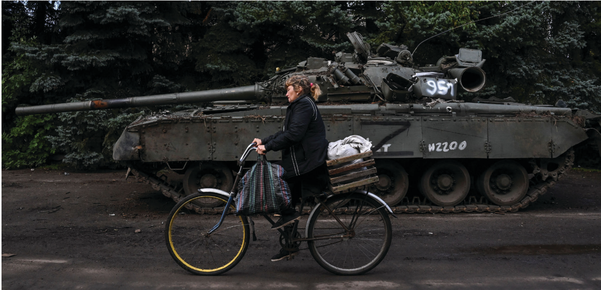
An abandoned Russian T-72 tank in eastern Ukraine in September 2022.