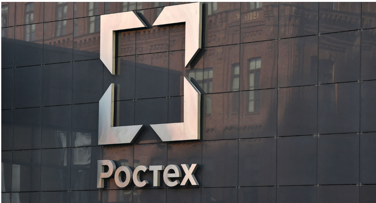
The Rostec headquarters in Moscow, Russia.

One of the government’s more tangible approaches includes funding existing defense enterprises to boost their production. Russian state-owned defense conglomerate Rostec is one of the chief enablers (and beneficiaries) of the Kremlin’s decision to pivot to domestic production. Rostec routinely advertises its capacity to help manufacture a range of modern weapons systems, including UAVs, tanks, aircraft, and missiles. 120 Since the start of the war, it has promoted its ability to create high-quality technologies that can be exported abroad, among them Russian-made anti-drone (the Repellent-1, RLK-MCE, RB-504P-E, and RB-504A-E) and anti-aircraft (the Pantsir-S1, Tor-M2KM, Tor-M2E, and S-350E Vityaz) missile systems. 121 Rostec is expected to attract a significant share of state funding, including 4.7 billion rubles (around $62.6 million) in the 2023 fiscal year. 122 Although the United States and its allies sanctioned Rostec and its subsidiaries in June 2022, specific transactions involving certain Rostec-affiliated blocked entities, such as those that ensure the safety of civil aviation, can still be authorized. 123 This might allow the defense conglomerate to circumvent sanctions by acquiring certain dual-use technologies through its affiliated firms involved in civil aviation. 124