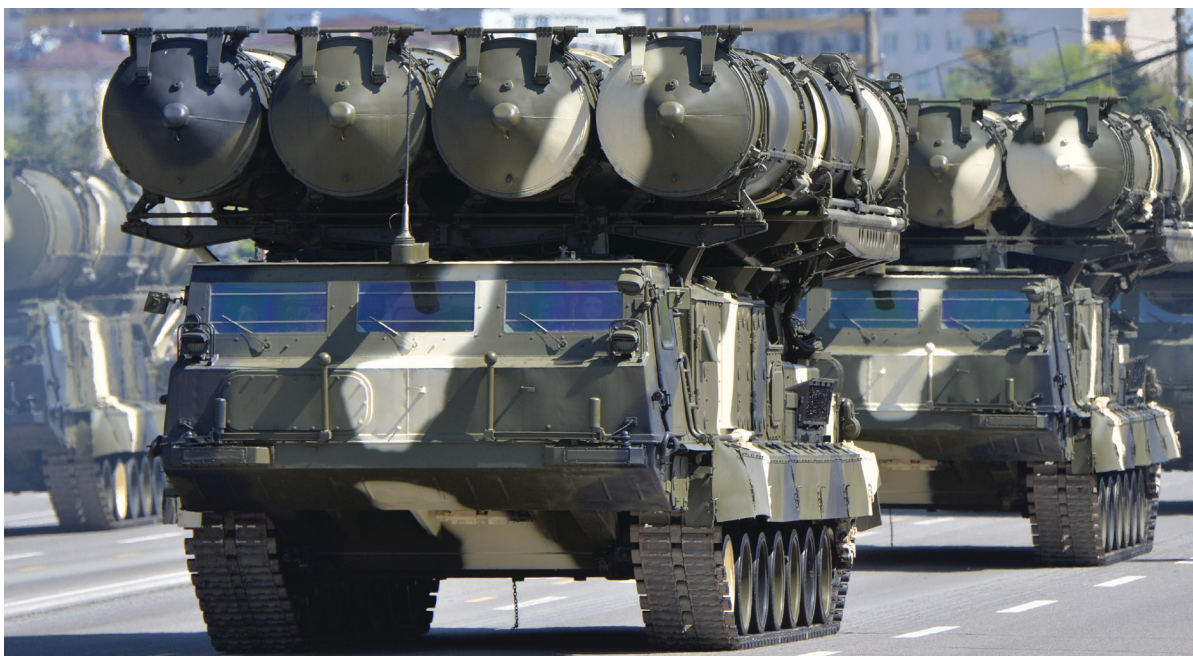
A Russian S-300 missile system presented during the Victory Day parade on May 9, 2015.

These stockpile losses might have diminished Russia’s ability to sustain the current rate of fire using modern precision-guided munitions, ultimately forcing Moscow to rely on its older and less accurate, yet more generous, missile arsenal and, in certain cases, draw on its stockpiles of nuclear delivery systems to sustain conventional missile strikes. 37 For instance, Russia has repurposed its S-300 surface-to-air defense missiles to hit ground targets in Ukraine. 38 While, as mentioned above, the S-300s are difficult to intercept, they are also less accurate, often exploding hundreds of yards from their initial targets. 39 Moscow has also repurposed its anti-ship missiles like the Onyx to strike surface targets, as well as the older Kh-55 missiles—initially designed to carry nuclear warheads—allegedly to exhaust Kyiv’s air defenses. 40